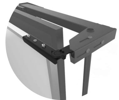
Winx® 4b Whiteboard Hinges (adjustable, 4x included)