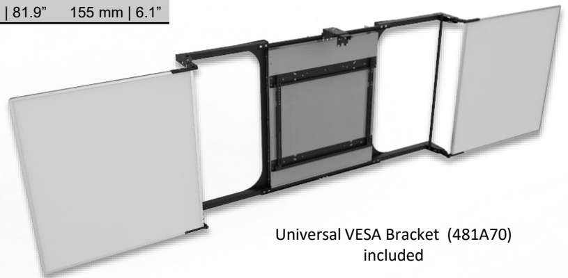
Universal VESA Bracket (481A70) included